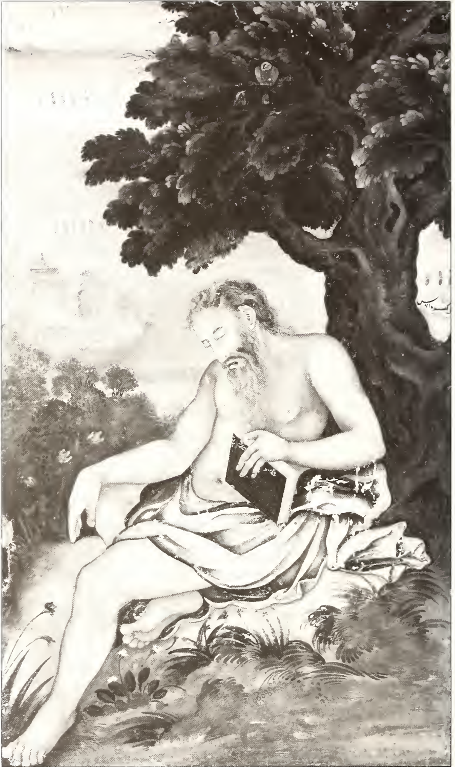
Figure 9. St. Jerome , by Kesu Das (act. ca. 1570–90). India, Mughal period, Akbar period, ca. 1580–85. Opaque watercolor on paper, 17 x 10. Musée National des Arts Asiatiques-Guimet, Paris